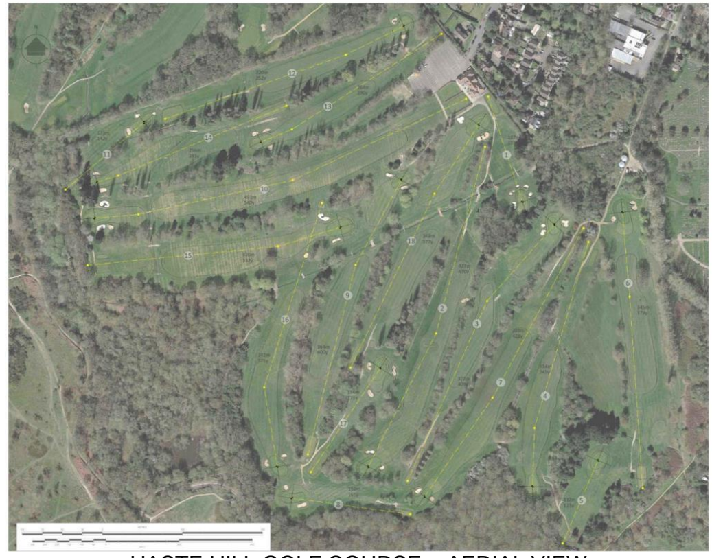
HASTE HILL GOLF COURSE - AERIAL VIEW

The following essential works would be a minimum investment to allow the course to trade to its optimum level and maintain its competitive position. These would involve irrigation and drainage improvement works and improvements to the greenkeepers compound at a cost of circa £700,000.