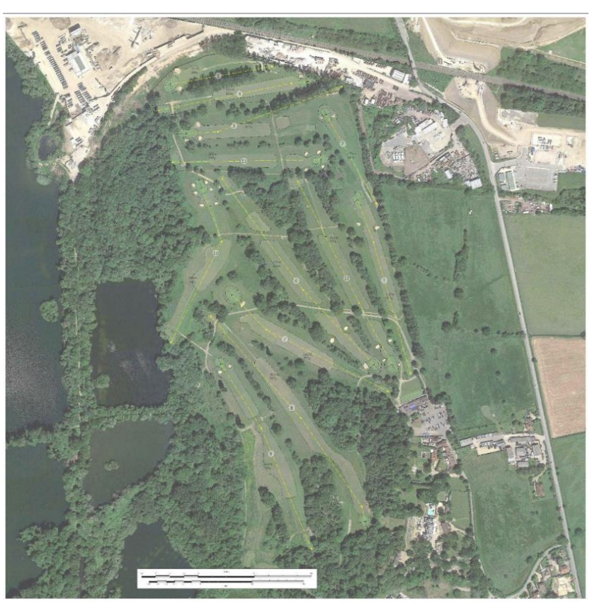
UXBRIDGE GOLF COURSE – AERIAL VIEW